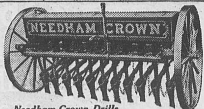
Needham Crown Drills

WRITE TODAY for CATALOG and PRICES CROWN MFG. CO. Box 112 PHELPS, N. Y.