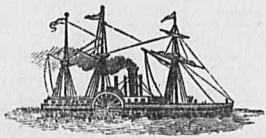
VESSELS ENTERED AND CLEARED